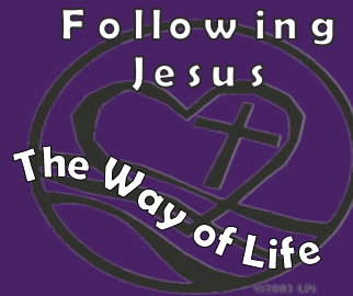
ST. JOSEPH'S PARISH